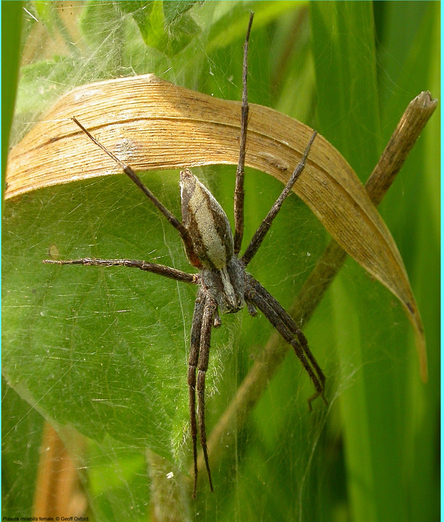
Pisaura mirabilis female. © Geoff Oxford.